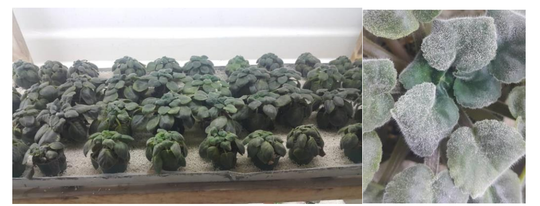
Figure 1: A view of produced African violet flowers (S. ionantha): left) healthy plants, right) powdery mildew-infected plant.

The rooted plantlets produced through tissue culture were transferred to pots during the adaptation stage and kept until the 10th leaf stage; subsequently, with increased humidity and contamination with infected leaves, a relatively uniform layer of powdery mildew formed on the leaves (Yari, et al., 2019). (Fig 1) shows healthy African violet flowers and those infected with powdery mildew.