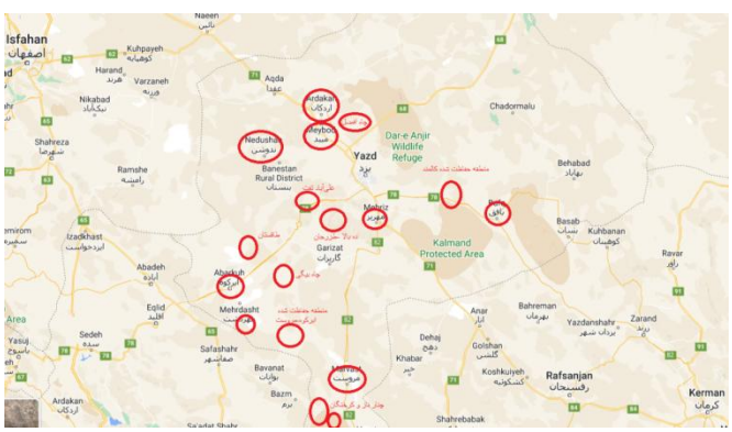
Figure 1. Plant sample collection areas for endophyte isolation in Yazd province.

Leaf, stem, and root samples of 112 plant species, including 18 old plant species and 96 salt-resistant desert plant species of the Amaranthaceae, Brassicaceae, Chenopodiaceae, Cupressaceae, Ephedraceae, Platanaceae, Polygonaceae, Tamaricaceae, and Zygophyllaceae from different regions of Yazd province, were collected within a distance of 1850 km, including Ardakan-Chah Afzal Desert, Abarkoh-Taghestan and Dasht Abarkoh to Marost, Herat and Marost, Mehriz, Bafaq, Taft and Mibd - Niuk and their subordinate areas (Fig. 1).