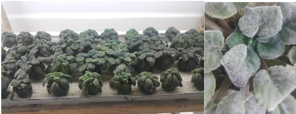
Figure 1: A view of produced African violet flowers ( S. ionantha ): left) healthy plants, right) powdery mildew-infected plant.

The rooted plantlets produced through tissue culture were transferred to pots during the adaptation stage and kept until the 10th leaf stage; subsequently, with increased humidity and contamination with infected leaves, a relatively uniform layer of powdery mildew formed on the leaves (Yari, et al., 2019). (Fig 1) shows healthy African violet flowers and those infected with powdery mildew.